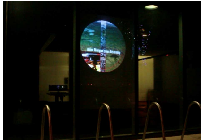
Figure 1. The Aesthetics of Activism work-in-progress at the Surrey Central Library, BC, Canada http://interactionart.org/the-aesthetics-of-activism